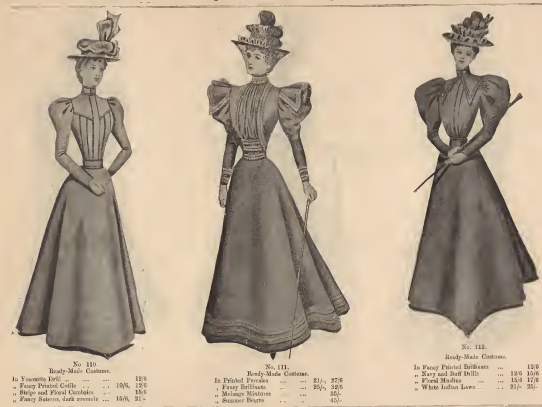
VICTORIA HOUSE, SYDNEY.