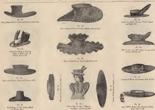
VICTORIA HOUSE, SYDNEY.